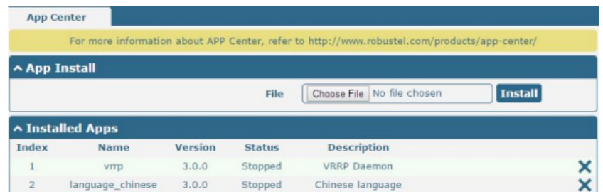
Screenshot from App Center page of Robustel router running 'RobustOS'